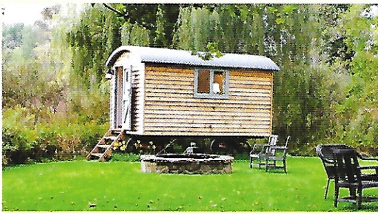
English shepherd hut at Camp Buttercup.

areas will provide a variety of experiences, including horseback riding, kayaking and canoeing, hiking, mountain biking and more among the property's rolling hills, nearby waterways and lush woodlands. Other amenities on the table include a fitness center, catered meals, cooking pavilions and more.