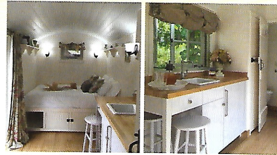
Shown above, the interior and exterior of a handcrafted